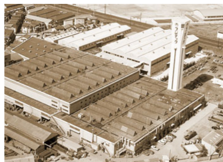
Osaka Plant featuring a 53-meter high elevator research tower (1965)