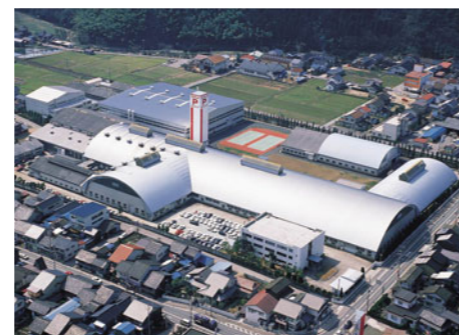
Hidaka Plant, an escalator manufacturing base, begins operations (1989)