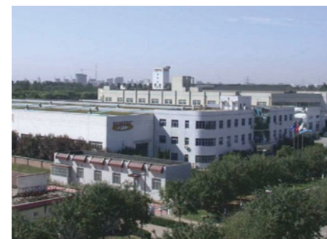
Establishment of Huasheng Fujitec Elevator Co., Ltd. (1995)