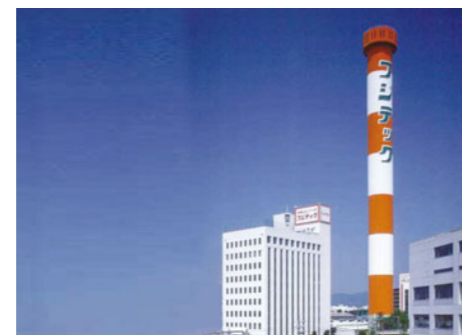
World's tallest and largest elevator research tower at that time (1975)