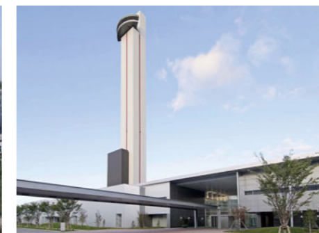
Completed construction of Head Office (Big Wing) (2006)